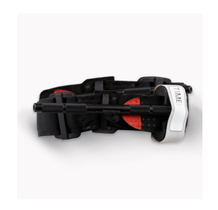
Tourniquet NOT INCLUDED