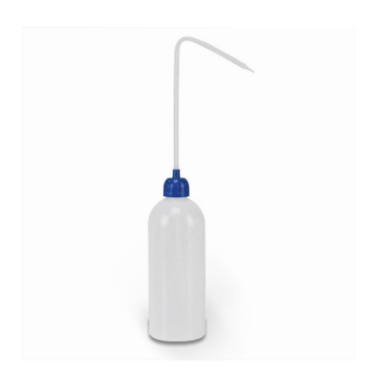
Application bottle INCLUDED