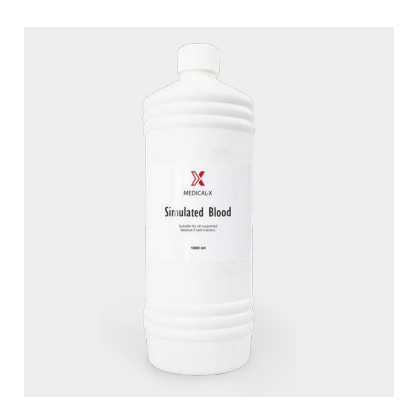
Simulated blood INCLUDED