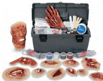
620 Xtreme Moulage Kit