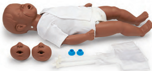
The Pediatric CPR Manikins come fully assembled and ready to use.